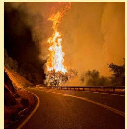
Retardent line, back burning along Ponderosa/Mira Monte Fuelbreak. Blazing Bull Pine on Buchanan Road.