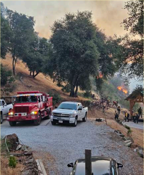
Crews working private property, located just above the Westside Trail on the morning of August 9th.

The Mira Monte Firewise Community, formed in 2020 is composed of individual property owners working together to maintain and further reduce flammable fuels on their properties. Each year they coordinate and work to tackle a project, and incrementally they have made progress to reduce fuels in their neighborhood. In addition to weed eating and hiring local businesses to reduce fuels on private property, the Mira Monte Firewise Community has coordinated with Hwy 108 Fire Safe Council, Tuolumne City Fire Department, Tuolumne Rancheria Fire Department, CALFire, Tuolumne Parks and Recreation and the Greater Valley Conservation Corp on a variety of fuel reduction projects within the fuel break area.